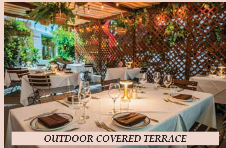
OUTDOOR COVERED TERRACE